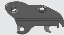
Hydraulic Quick Coupler

Enables cost-effective grading, sloping and land clearing. The bucket rotation has a tilt of 45 degrees in either direction. Universal hydraulic connections attach and detach hydraulics easily. The short tip radius and compact design deliver maximum strength.