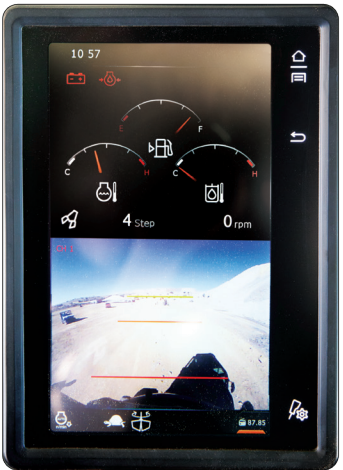
8-inch screen shown.