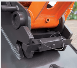
Wedge Lock Quick Coupler