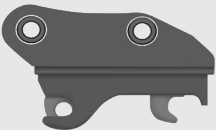
Hydraulic "Pin Grabber" Quick Coupler